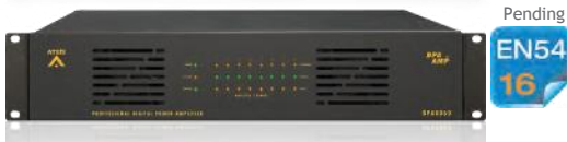
DPA DPA8060/DPA4125/DPA4250/DPA2500 Digital Class-D Power Amplifier, 48VDC Backup