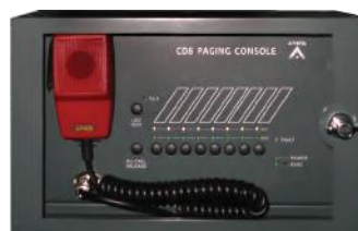
CD8 / CD16 Wall Mount Paging Console