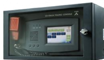
CD-Touch Wall Mount Touch Screen Paging Console