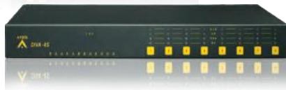
DIVA8SG2 Compact PA/VA System Slave Unit