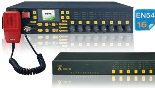
DIVA8MG2 Compact PA/VA System Master Unit