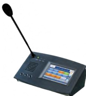
EN54 16 PSS G2 Colour Touch Screen Paging Console