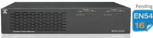
BPA BPA-1120/BPA-1240/BPA-1480/BPA-1000/BPA-2060 BPA-4060/BPA-2120/BPA-2240/BPA-2480 Bridging Power Amplifier, 48VDC Backup