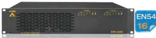
SPA SPA2120/SPA2240 Security Power Amplifier, 24V Backup