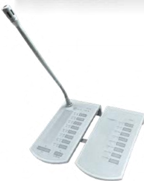
PSM Desktop Paging Console